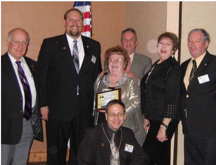
Missoula Tough Tuskers

Thanks to all of you for participating in the special evening.